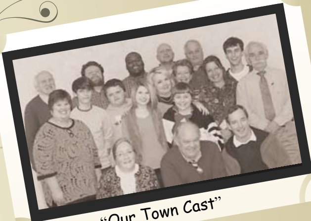
"Our Town Cast"