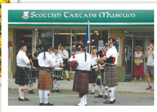
BY: ABIGAIL SUTTON

Nestled in the foothills of the Great Smoky Mountains the township of Franklin is preserving western North Carolina's rich history and heritage, the area was once the center of the Cherokee Nation and became a destination for Scottish immigrants seeking freedom in the new world, now Franklin exemplifies "Small Town, USA" and, through several museums, provides a window back to a time before paved roads offered access to and from towns and when the mountain wilderness was...well, wilderness.