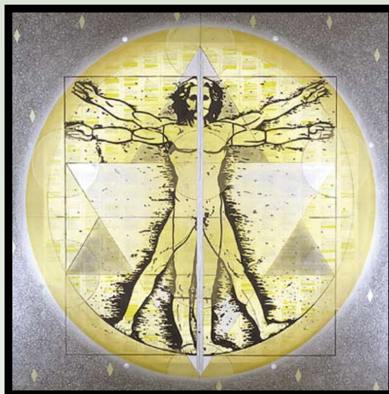
“Canon “ 2005 Acrylics, pages of the I-Ching on Hexcell aluminum panel 96” x 96 “