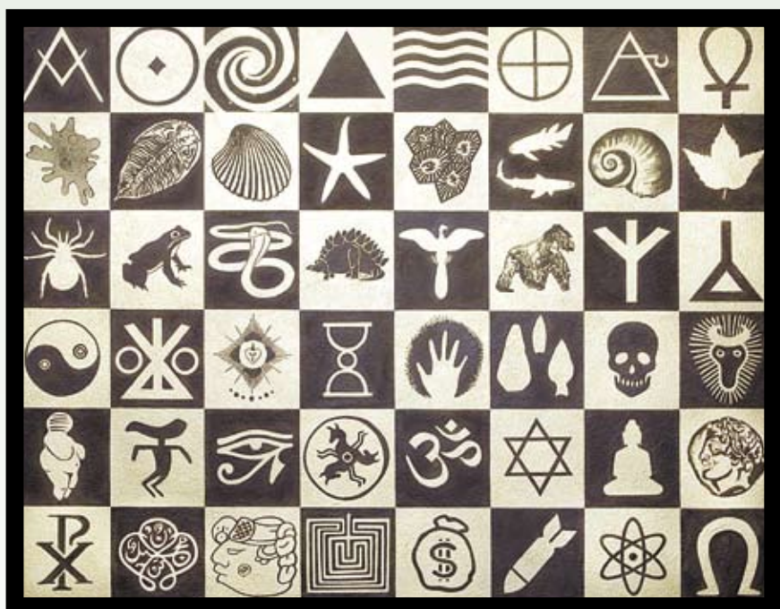
“Alpha/Omega” 1989 Acrylics, enamel paint, glass microspheres on canvas 84” x 108