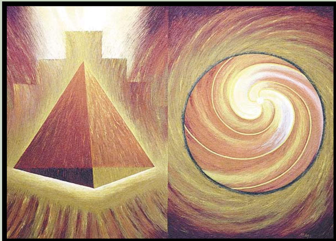
“Power of Myth” 1988 Oil, sand, on canvas 64” x 88”