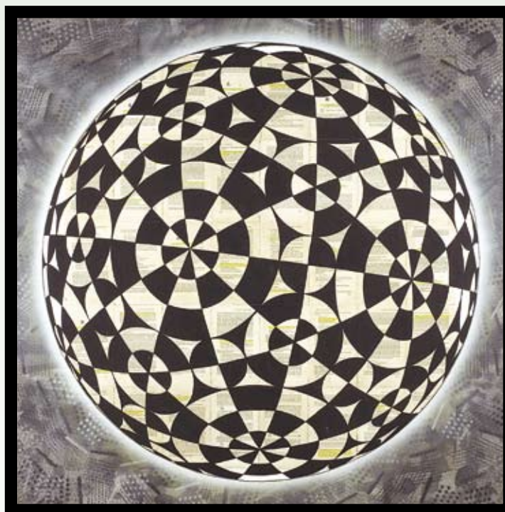
“Tao Te Spherico” 1994 Acrylics, pages of the I-Ching on panel 48” x 48”